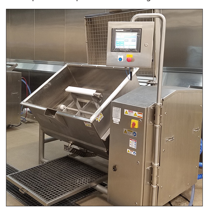
TECV-200T shown tilted forward for easy cleaning

The TUCS TILTING COOKING VESSEL is a low rim height, tilting, trough-shaped vessel with a horizontal mixing scraper agitator for the production of liquid, semiviscous and viscous products (soups, sauces, stews, mashed potatoes, refried beans, etc.). This agitator lifts the heavy particulate off the bottom and moves them to the top while pulling the floating particulate to the bottom, in a gentle mixing, folding action. An optional variety of blending agitators for different products are available upon request (protein and non-protein salads, meat mixtures, etc.). The vessel tilts to pour out liquids, aid in the discharge of solid non-pumpable products and provide access for easy cleaning. The vessel has a 3" air-operated, flush-mounted drop-down valve for the attachment to a Tucs volumetric piston pump or another pumping device. Pre-piped for single point attachment to utilities and an integrated digital control panel with a pendant mounted digital HMI.